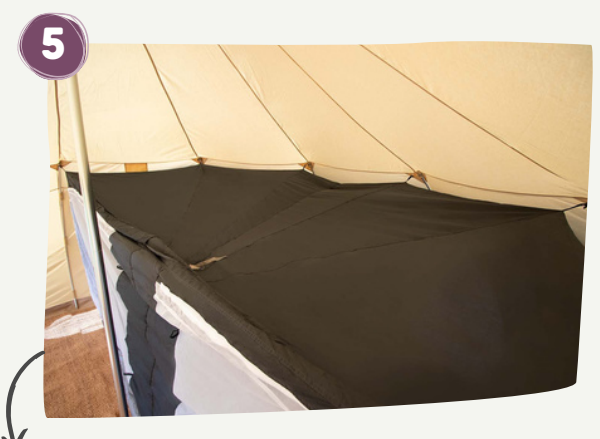
WORKING YOUR WAY AROUND, REPEAT ALL THREE STAGES AT EACH CONNECTION POINT.