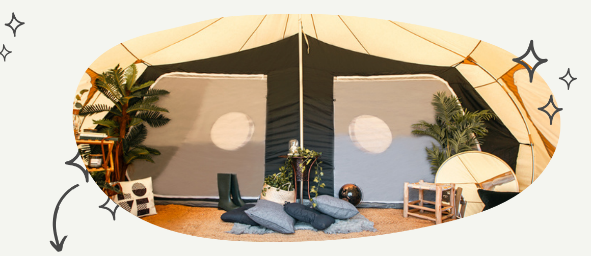
USE YOUR NEW SEGREGATED SPACE TO ACCOMMODATE A PRIVATE SLEEPING AREA, TO STORE BELONGINGS OR TO HOST IN A COMMUNAL SPACE.