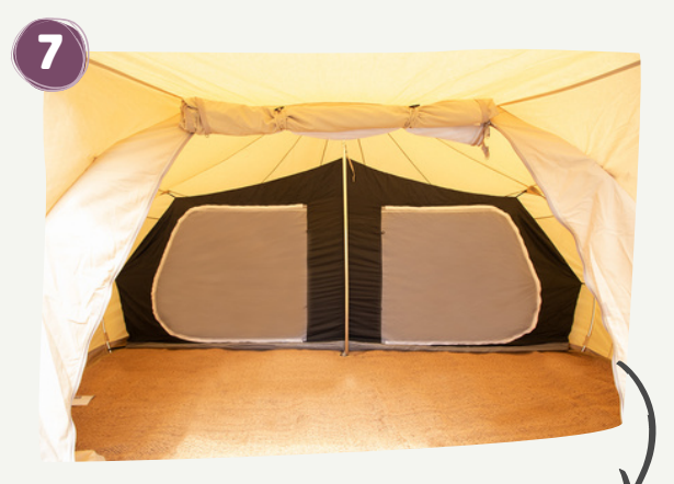
YOUR INNER TENT SHOULD NOW BE FULLY INSTALLED AND LOOKING AS PICTURED!