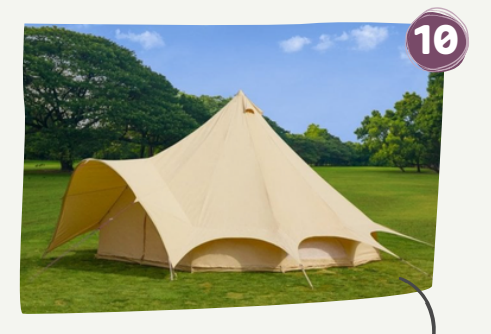
10A. ADJUST THE WEBBING GUY ROPES TO CREATE DESIRED TENSION UNTIL YOUR STAR BELL TENT LOOKS AS PICTURED.